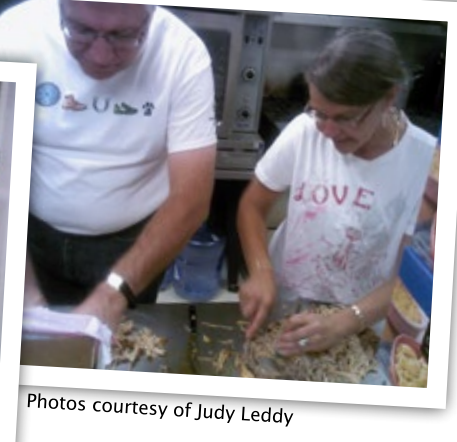
Members of St. Patrick's Pastoral Council and family members prepare a feast for the Annual Pig Roast on Rosary Sunday!