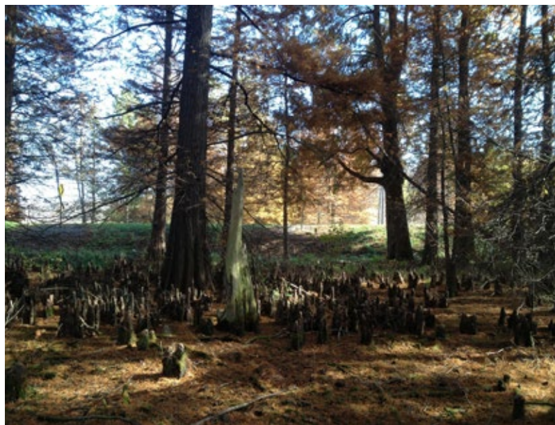
Frassati Society visits Dawes Arboretum