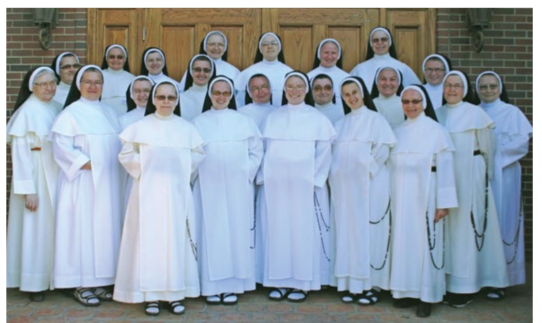
Pictured above are most of the sisters working in the Immaculate Conception Province of the Dominican Sisters, including the US and Canada. There are sisters who work in Canada, Wisconsin, Illinois, Arkansas and now in Ohio.