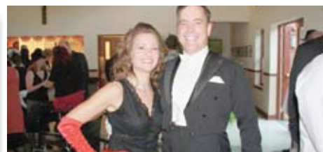
Cocktail Party – 1920s Style Page 7