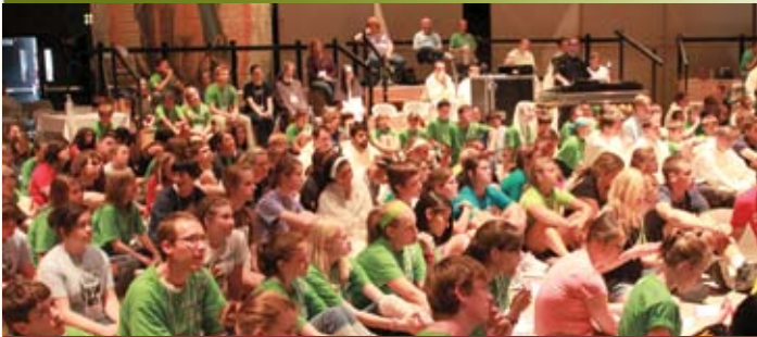
Credo Retreat Page 4