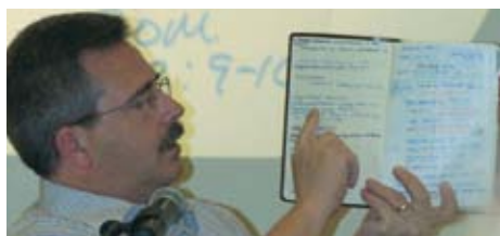
Patrick Madrid Apologetics Page 2