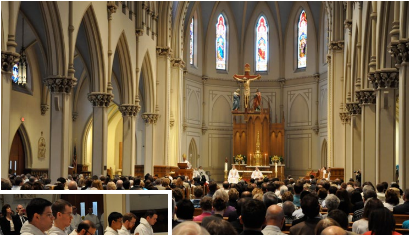
Inside of Saint Dominic Church in Washington, D.C., where Ordinations took place.