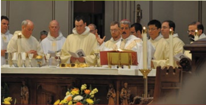
Celebrating Ordinations Page 1