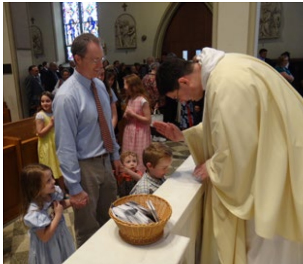
First priestly blessings