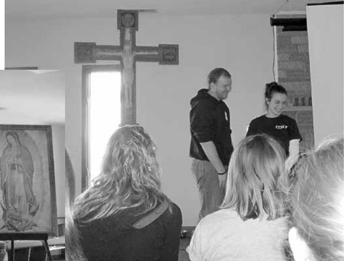
With Jesus on the cross nearby, ministering to teens seems much easier!

Another big factor that went into making this retreat so meaningful to me was Adoration of the Blessed Sacrament. Adoration gave me a chance for some personal prayer time in front of Jesus present in the Holy Eucharist and journaling time. It was nice to take a break, sit down and just be with Jesus. One thing that was