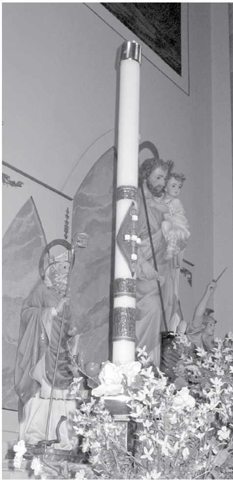
The Paschal Candle in the Sanctuary: Announcing to All: Christ is Risen from the Dead! Alleluia!