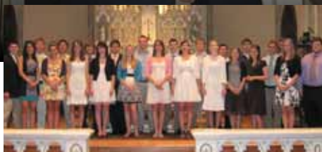
10 Years Strong, Youth Ministry