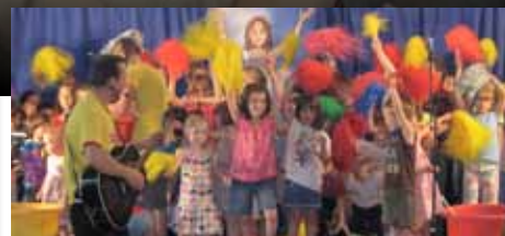
Family Life Ministry Cat Chat