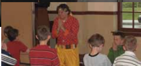
First Communicants on Retreat