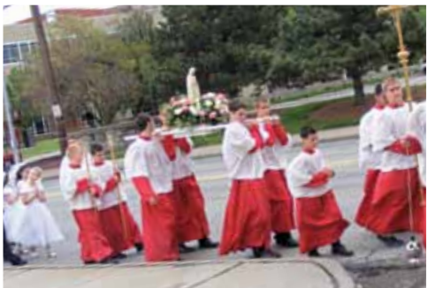
Blessed Virgin venerated at May crowning