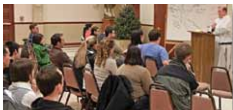
St. Patrick's 20s Group Page2