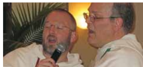
Twelfth Night Page 5