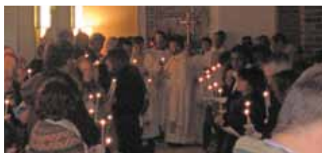
Candlemas Page 3