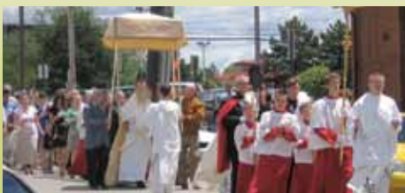
Corpus Christi Procession