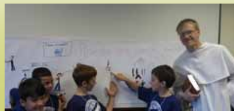
Vacation Bible School