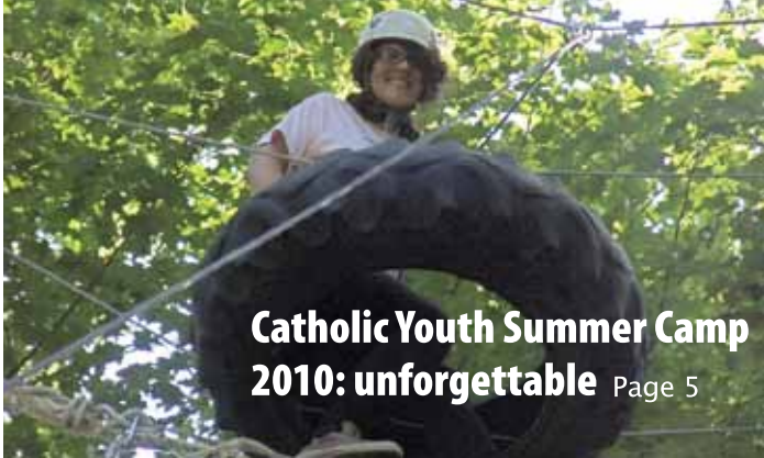
Catholic Youth Summer Camp 2010: unforgettable Page 5