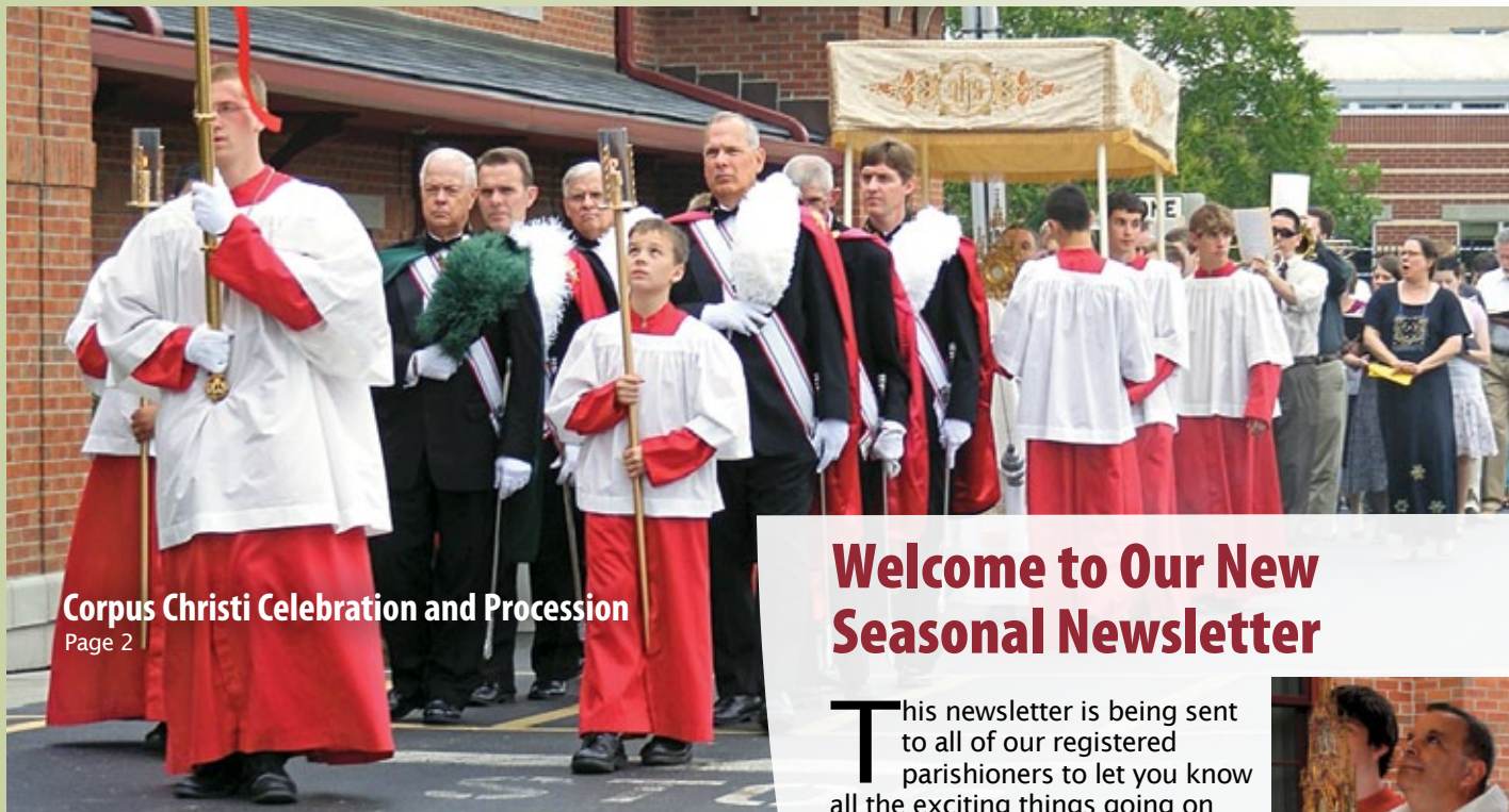
Corpus Christi Celebration and Procession

Dominican Friars: Province of St. Joseph | St. Patrick Church, 280 N. Grant Ave, Columbus, OH 43215-2652 | (614) 224-9522