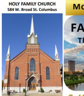
FATIMA PROCESSION Through Downtown Columbus