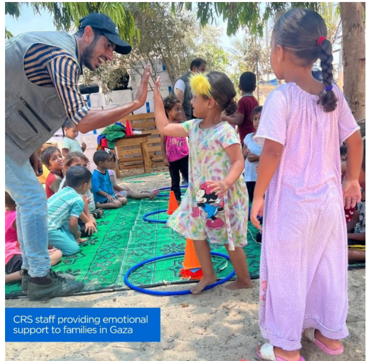
CRS staff providing emotional support to families in Gaza

Submit at: keelinjohnson@stpatrickcolumbus.org